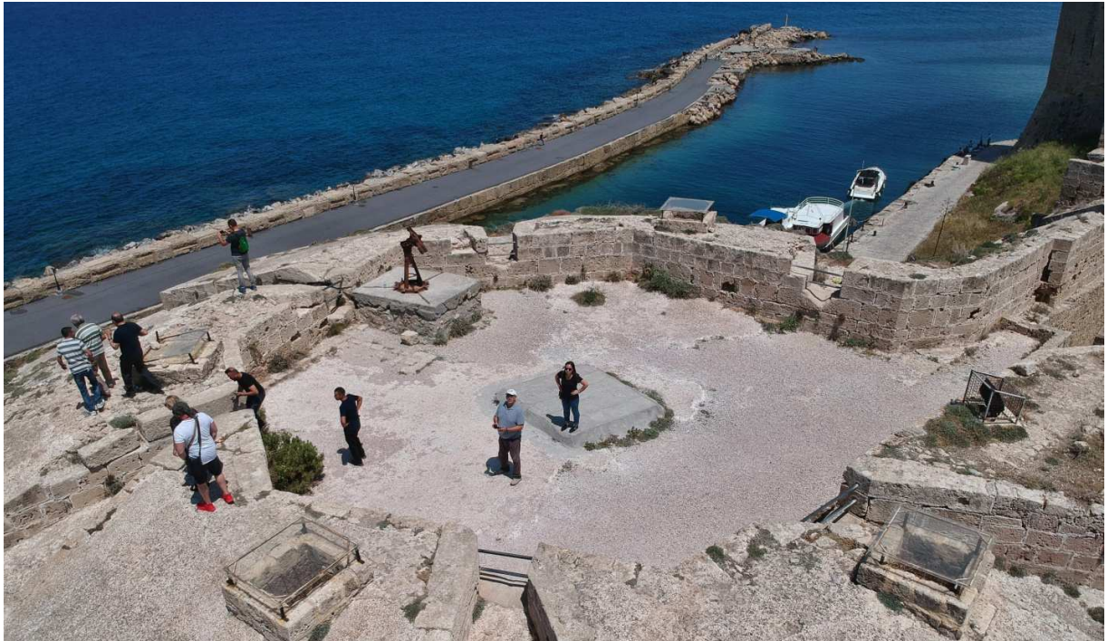
Fig. 3. Operations with the drone on the walls of the Kyrenia Castle