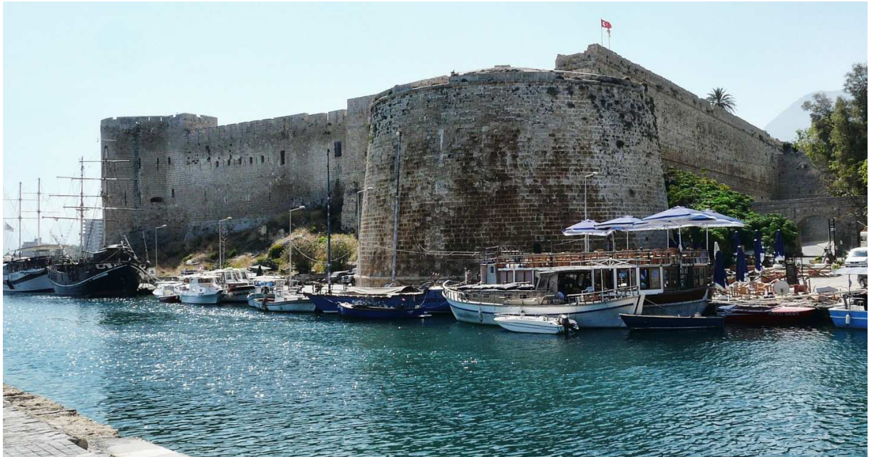
Fig. 1. View of the Kyrenia Castle from the harbour