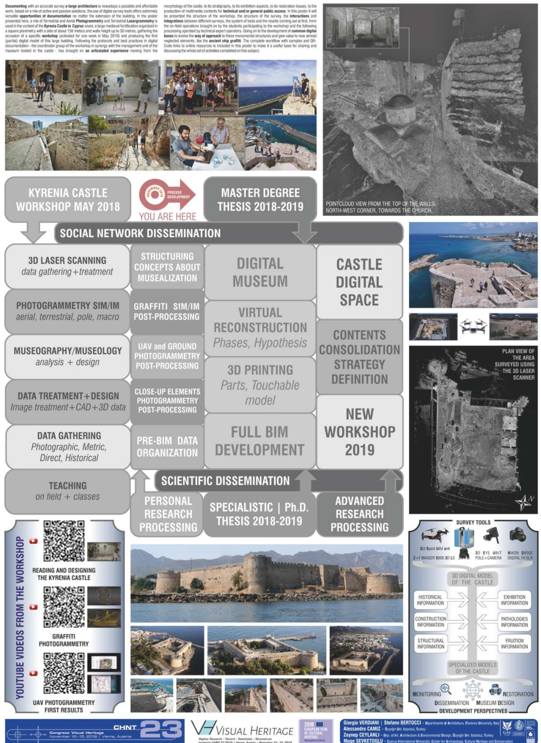
Fig. 6. The poster (original in UNI A0 format) as presented in occasion of the Cultural Heritage and New Technology / Visual Heritage Conference, Vienna, 2018