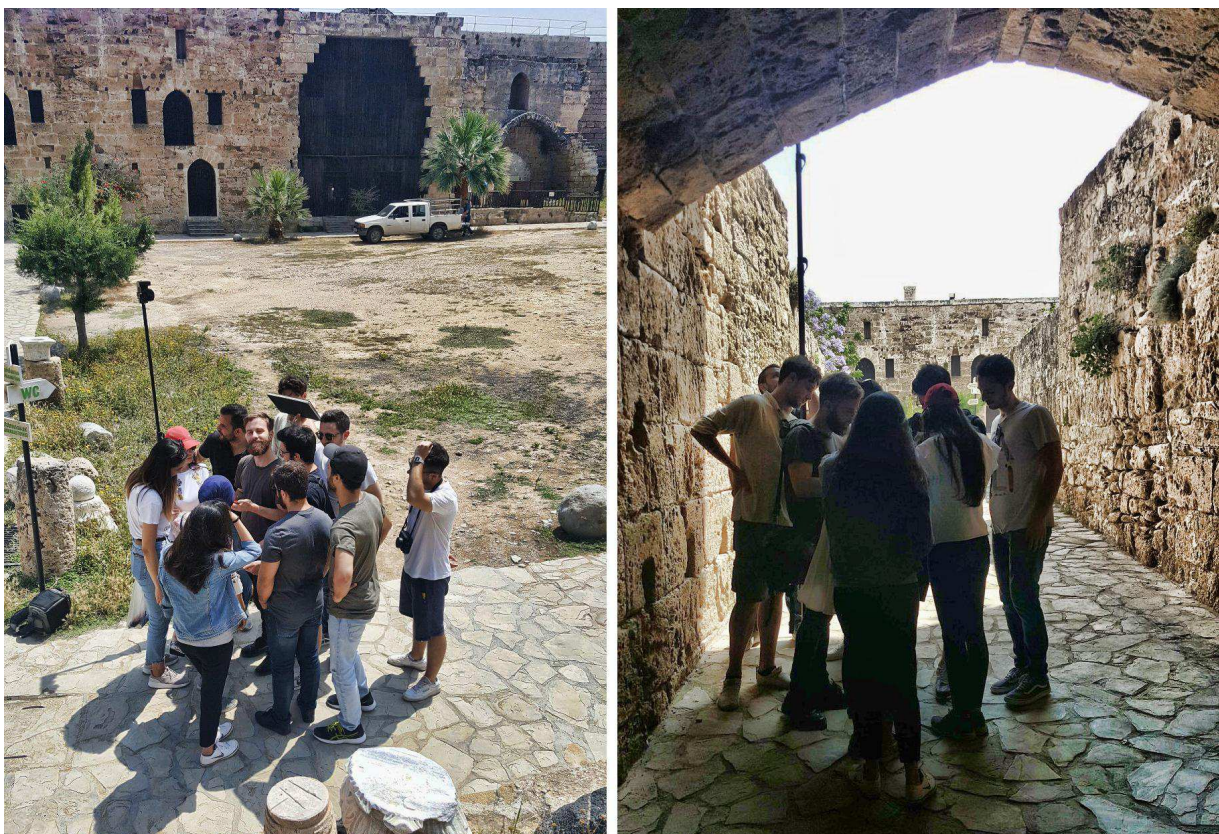
Fig. 2. A group of participants to the workshop working with the 3D Eye unit